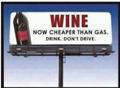
Stolen from Redlands Apex 40 Thanks Bill Cramp