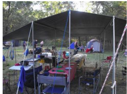
Crest Blue Mountains Apex 40 enjoying Wolgan Valley