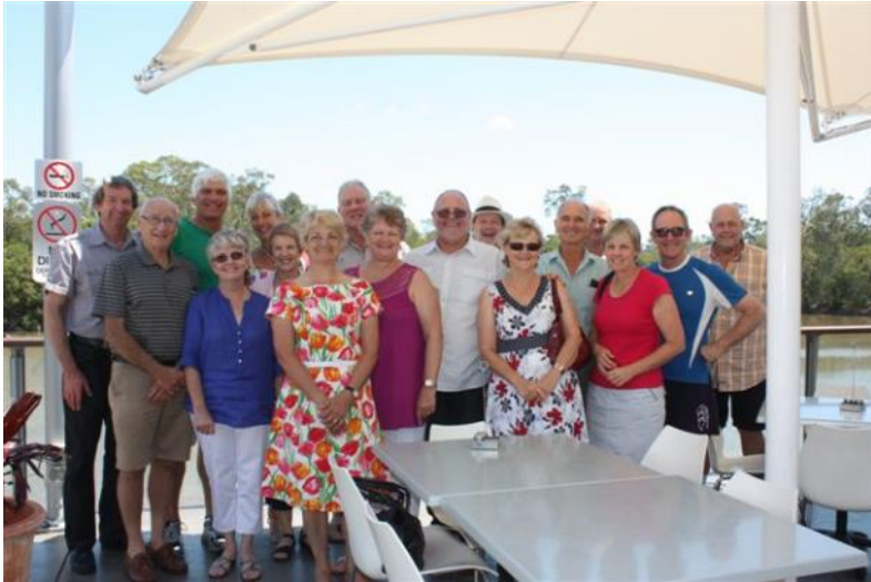
Members of the XEPA group at their AGM